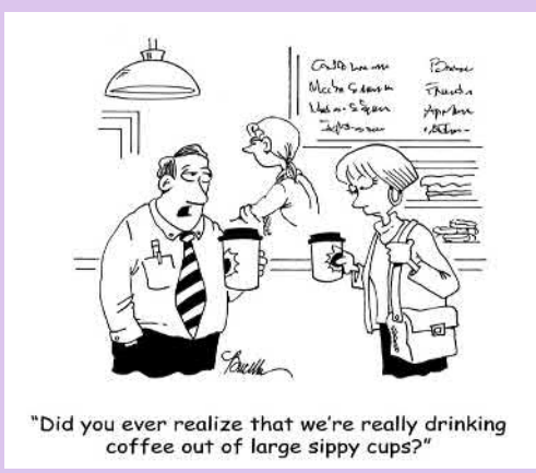
"Did you ever realize that we're really drinking coffee out of large sippy cups?"

Drizzle the dressing lightly across the top and place a bowl of it on the table as a condiment. Green Goddess dressing can be substituted as the drizzle.