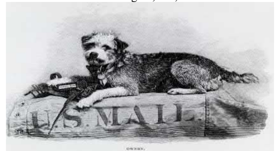
models and tags are on display

He is still honored at the Smithsonian National Postal Museum in Washington, DC, where 397 of his