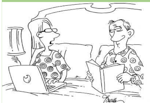
“Have you ever thought of having yourself digitally restored?”

Interestingly, a study in 1976 published in Science magazine speculated that the girls might have had convulsions because of a fungus found in cereals. Toxicologists say the fungus can cause delusions, vomiting and muscle spasms.