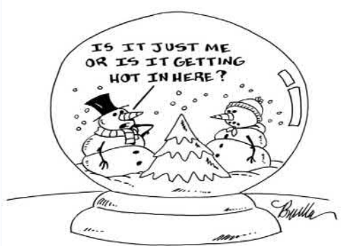
Snow Global Warming

Project Loon takes specially built balloons that can fly high above the ground and, with the help of solar-powered relays, spreads LTE cellular service from companies like AT&T and T-Mobile over an incredible area. Puerto Rico became a proof of concept for the company who ultimately wants to be able to spread internet globally to everyone.